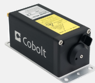
Cobolt o6 MLD laser

Until recently the most common approach would be to combine a laser with an acousto-optical modulator. Now, however, the same performance can be achieved with modulated diode lasers, which makes the set-up more compact, more robust and easier to align. “Modulated diode lasers from HÜBNER Photonics are popular for initializing and reading out spin-states because they offer fast modulation capabilities, a high on/off extinction ratio, a high level of spectral purity, as well as an excellent Gaussian beam profile” comments Waasem.