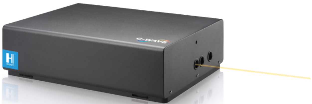
The C-WAVE from HÜBNER Photonics combines wide tunability with a narrow linewidth needed and a higher spectral purity than equivalent tunable lasers.

Quantum researchers have been quick to recognize the benefits of continuous-wave OPOs for assessing the potential of different single-photon emitters. For example, scientists from the USA, Germany, China, Singapore, and Japan have exploited the C-WAVE platform to measure the photoluminescence spectra from silicon, germanium and tin vacancy centres in diamond, none of which suffer from the same sensitivity to electric field as nitrogen defects.