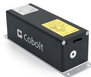
Fig. 3 : Cobolt o8-NLD laser suitable for Raman spectroscopy